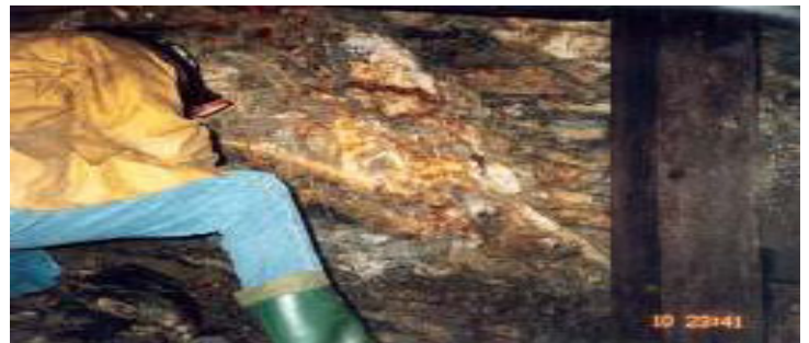
Exposed quartz vein in existing mine development on Gemco's Burns Mountain Property

Gemco Minerals Inc. #203 – 20189 56 th Ave Langley, BC, V3A 3Y6, BC, Canada Tel: 1-866-848-2940 Fax: 604-468-3955 Website: www.gemcominerals.net Email : info@gemcominerals.net